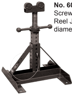
No. 60 (Part # 11860) Screw-type Telescoping Reel Jack for 26 to 56" diameter reels.