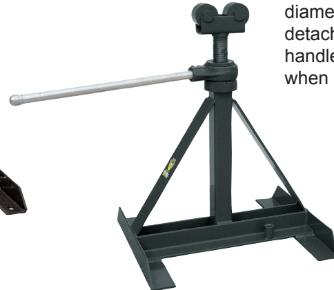
No. 80 (Part # 11880) Heavy Duty Ratchet Drive Reel Jack for reels up to 90" in diameter. Convenient, detachable ratchet handle stores in base when not in use.