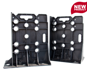
► Rack-A-Tiers XL Part #11470

► How does the Rack-A-Tiers XL Wire Dispenser stack up against the Original Rack-A-Tiers Wire Dispenser ?