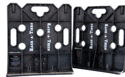
► Original Rack-A-Tiers Part #11455

HOLDS REELS UP TO: 40" IN DIAMETER REEL WEIGHT RATING: 500 LBS (226KG)